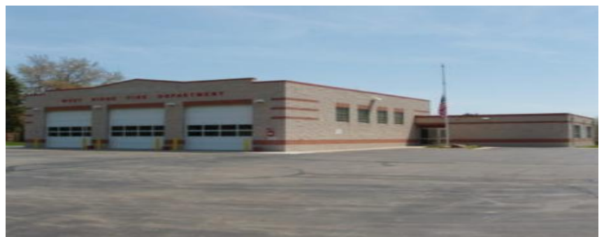
West Ridge Fire Department 4775 Sterrettania Road Erie, Pennsylvania 16506 (814) 833-8401